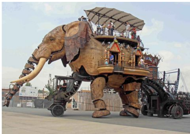
One fantastical Machine de L'Ile in Nantes