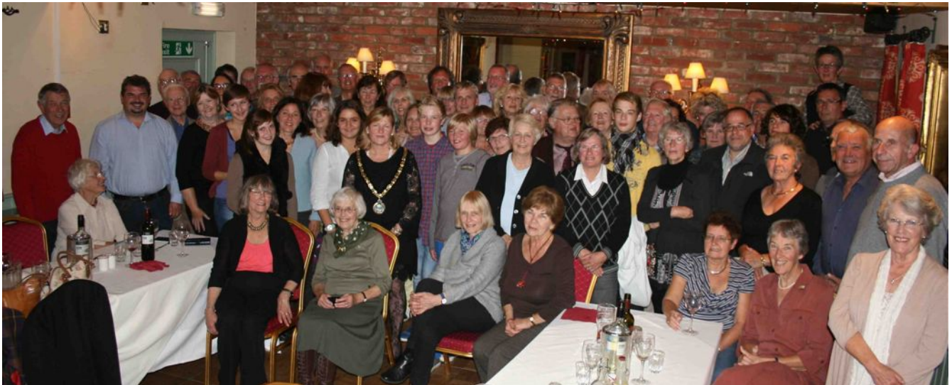
LITA hosts and Mosbach guests at the Walhampton Arms