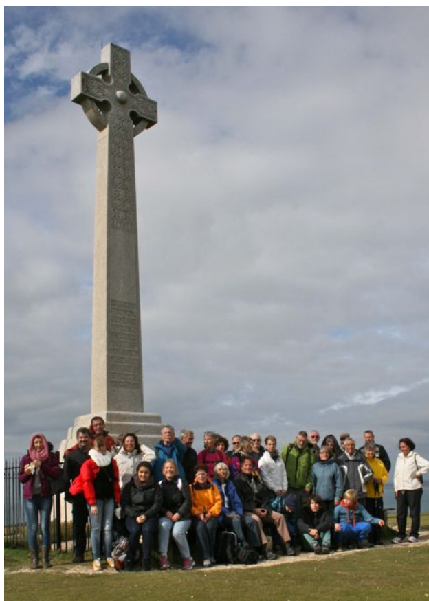
The LITA party at the Tennyson Memorial

To the relief of the organisers of the visit, Sunday dawned dry if a bit cloudy, as the party, accompanied by a few hosts, took the Yarmouth ferry and thence the Needles Breezer bus to Freshwater Bay. There everyone enjoyed elevenes of coffee and delicious homemade cakes at the Dimbola Lodge Tea Rooms, before all but three set off to walk over Tennyson Down to the Needles, pausing at the Tennyson Monument to take in the fine views.