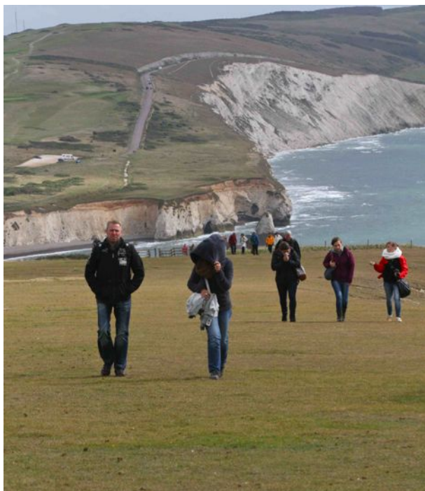
Part of the Mosbach-LITA crocodile heads from Freshwater Bay bound for The Needles

Eighteen LITA families welcomed thirty-two twinning guests from Mosbach, including seven children and teenagers, for their long-weekend visit. The five teenage guests had come as a reward for good performance in their English studies at the various secondary schools in Mosbach, while the two younger children accompanied their parents.