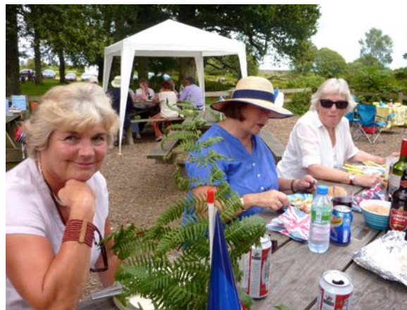
LITA takes over Wilverley Plain for the barbecue [CB]