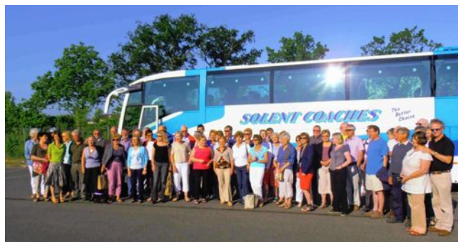
A final group photo before departing [SC]

We left the following morning having said fond farewells to our friends in Vitré. Some LITA members were travelling onwards on various holidays but those returning to Lymington had time to stop at the Pegasus Memorial on the Caen-Ouistreham canal before catching the Portsmouth ferry home.