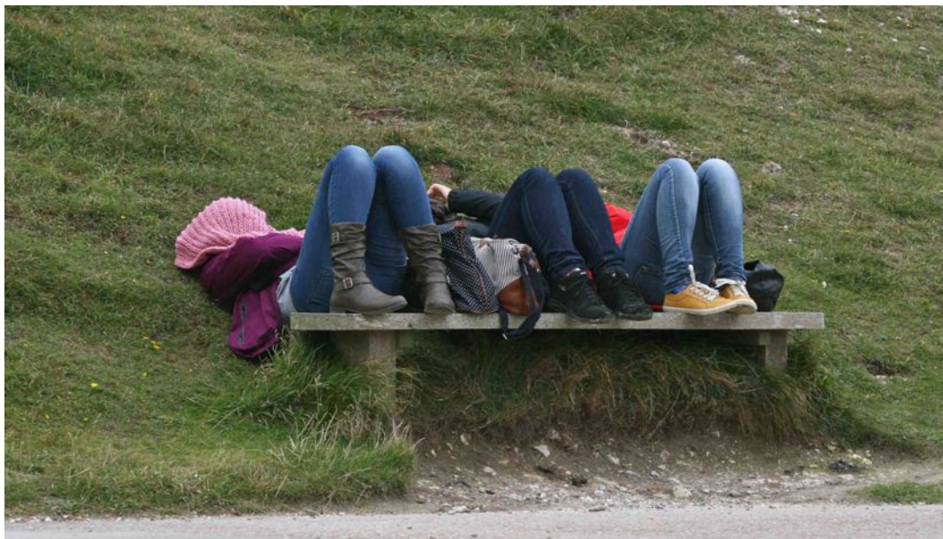
Exhausted – younger members of the Mosbach contingent recover at The Needles Battery [DJM]