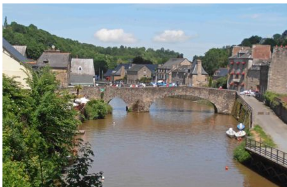
Picturesque Dinan

the creatures. Our hosts had prepared picnic lunches that we ate sitting by the river Loire in warm sunshine. In the afternoon we visited the wonderfully restored Chateau des Ducs de Bretagne . The guided tour, specially arranged for us, revealed some of the history of the chateau and the most important exhibits. After a busy day we returned to our families for a welcome dinner.