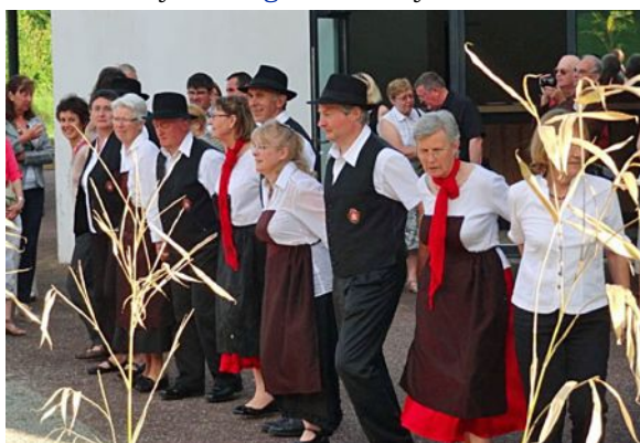
Breton Dancing display at Pocé-les-Bois

We spent the following two days with our hosts. Several of the French families took their guests to Dinan, a lovely old Breton town set on a hill and looking all the more delightful in the bright sunshine. Some were able to enjoy time on the beach at St Malo. Another popular destination was the Jardins du Haute Bretagne north of the medieval city of Fougères . Lovely.