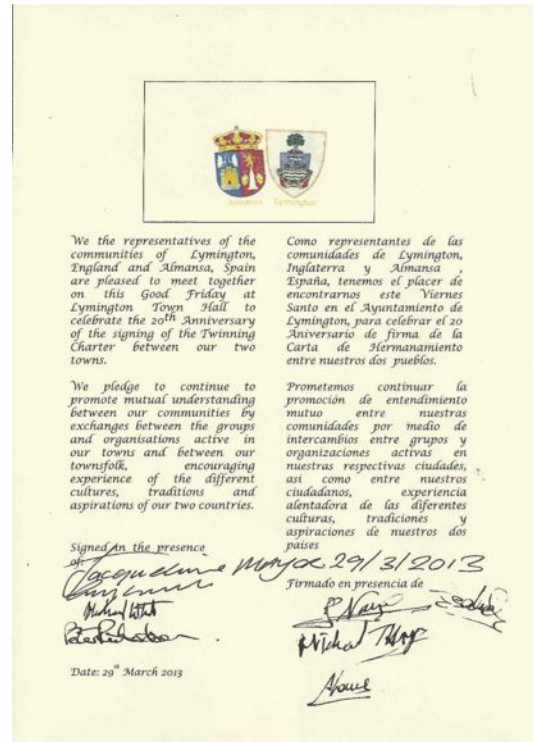
The document recording 20 years of Twinning