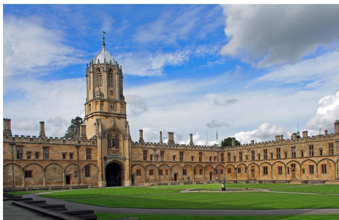
Tom Tower, Christ Church College Oxford

Following on from our wonderful exchange trip to Mosbach in 2017, a group from Mosbach will be visiting us in late August. They are coming by coach this time – a long journey for them but with the promise of seeing the white cliffs of Dover (...apparently!?). They have also expressed the desire to have a day out in Oxford.