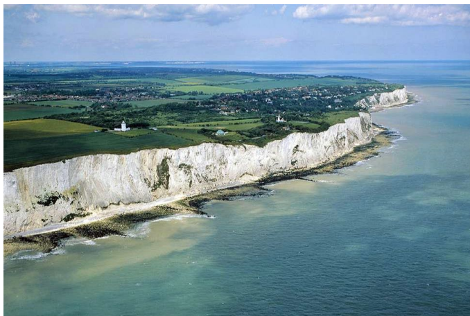
A White Cliffs Welcome

Next LITA visit from Mosbach 30th Aug-3rd Sept 2018