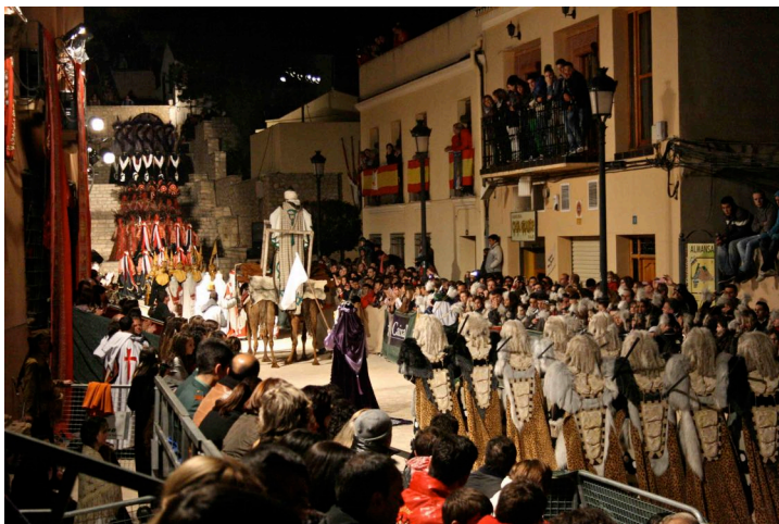
Almansa's 'Christians & Moors' festival parade