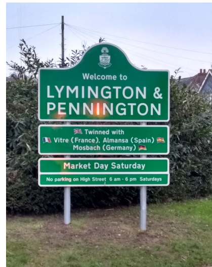
Bridge Road (the railway crossing)

Observant LITA members will have spotted the new 'Town' signs at the various entrance roads into Lymington. Regrettably, as with their (literally) long-standing predecessors, the e-aigu (e-acute) accent is missing from the name of our twin-town of Vitre. Domage!