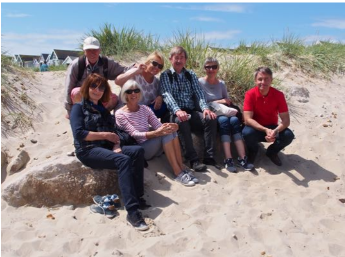
Twinnings beach party at Hengistbury Head

The last visit from Mosbach took place from Thursday 4 th to Monday 8 th August last summer (...remember last summer!?). The coach collecting the Mosbachers from Heathrow duly delivered them to Elmers Court Hotel to meet up with their hosts.