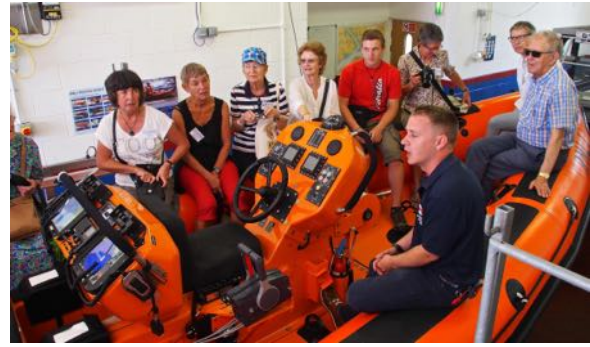
Trying the Lymington Lifeboat for size ...

Friday morning saw a number of our guests enjoy coffee, cake and the fine views from the balcony of Lymington Town Sailing Club. Many then joined a tour of the nearby Lifeboat Station where the volunteer lifeboatmen gave us the chance to clamber into their nearly-new inshore lifeboat and to see their changing rooms, replete with specialist clothing and gear.