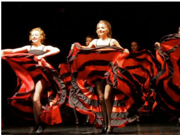
Polish Can-Can dancers (from the 2014 Vitré trip)

A large group of some 59 from Vitré will be visiting us from June 3 rd to 5 th . For various logistical reasons the visit is rather more brief than usual. The programme planning is well advanced and is expected to include a visit to Arundel (in the hope that the weather will be as good as it was for the Mosbachers last summer!). As is customary, we will have a meal with the visitors and their hosts together. It is regretted that, with the group from Vitré in particular being so large, there is no opportunity for LITA members to take part in that event, other than those who are hosting. However, non-hosting members can often meet some of the visitors informally through friends who are hosting.