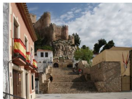
The Castillo in cenrtal Almansa

Our next visit to Almansa will be in 2018. After two unusually timed visits triggered by the 20 th anniversary timings, we have now reverted to the standard biennial exchange visits. We will keep members informed as we hear more.