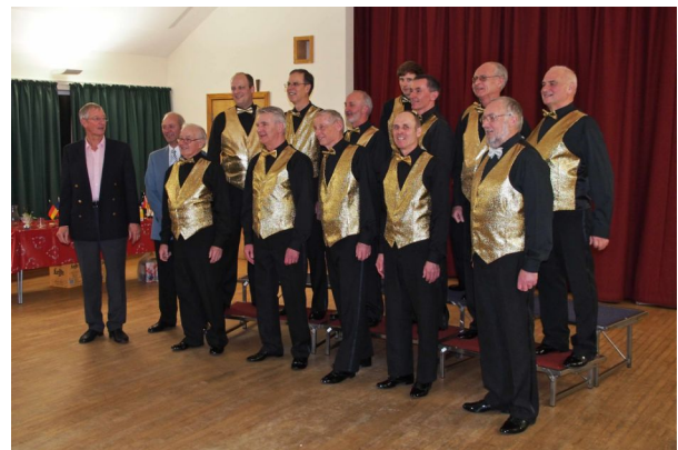
Our Chairman with Ocean Harmony

We were well entertained at our Christmas party in December by Ocean Harmony , a barbershop chorus whose name inspired the 'boarding cards' on each table, with images of grand liners. After mingling over a glass or two of mulled wine, everyone enjoyed a delicious meal, crackers were pulled and glasses raised to get Christmas off to a good start. Ocean Harmony performed two sets and really made the evening swing. There were some good old Christmas favourites, great songs from the 50s and 60s, including a super 'Bye bye love' and a rousing 'Do you hear the people sing?' from 'Les Misérables'. There was even the chance for a bit of audience participation.