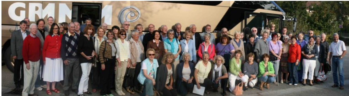
Mosbach - our group departs